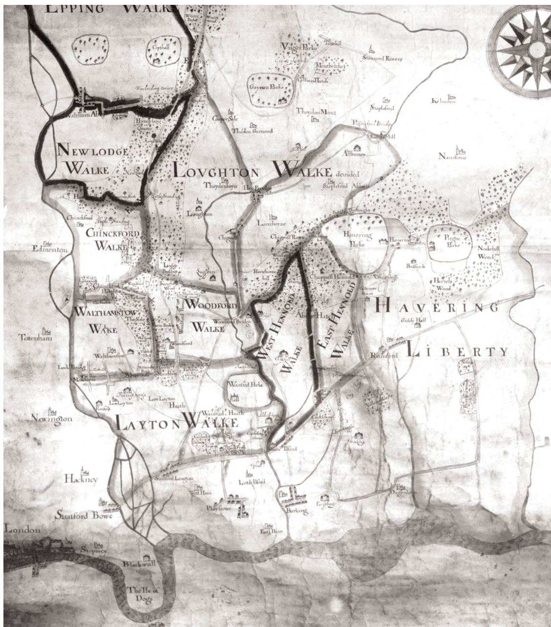
Fig. 1. A near contemporary map of the Forest of Waltham shows the boundaries of the ten Forester's Walks as they were in Oxford's time. The building at the very bottom of the map is Greenwich Palace, on the south bank of the meandering Thames, directly across the river from the Isle of Dogs. Stratford-at-Bowe is just to the north-west, then Hackney a short walk further. The Liberty of Havering is the largest "Walk," on the right. Havering Park is in its northwest corner, almost the center of the map, with Pirgo Park to its right. The palace of Havering-atte-Bowre is at the eastern edge of the Park. Just west of Havering Park is "Chappell Hennold" (Chapel Hainault), at the center of an area more thickly covered with trees than most of the map. The largest area still thickly forested, running south to north near the western edge of the Forest, remains today as the Forest of Epping. Theydon Mount (aka Hill Hall), home of Oxford's tutor, Sir Thomas Smith, lies to the north in the center of Loughton Walk. Gidea Hall ("Giddy Hall"), childhood home of the Cooke sisters, is just under the V of "Havering." "Playstowe" is towards the bottom of "Layton Walke." (Used with permission of the ERO.)