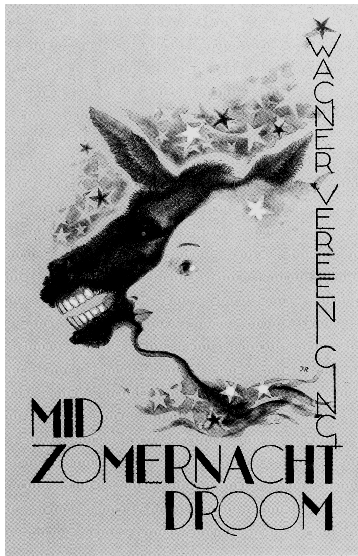
1936 poster for a Netherlands production of Dreame

3 Surprisingly, this contradiction has not to my knowledge been previously considered by students of the play’s chronology.