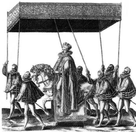
The duc d'Alençon on his entry into Antwerp (1572) as figurehead ruler of Flanders.